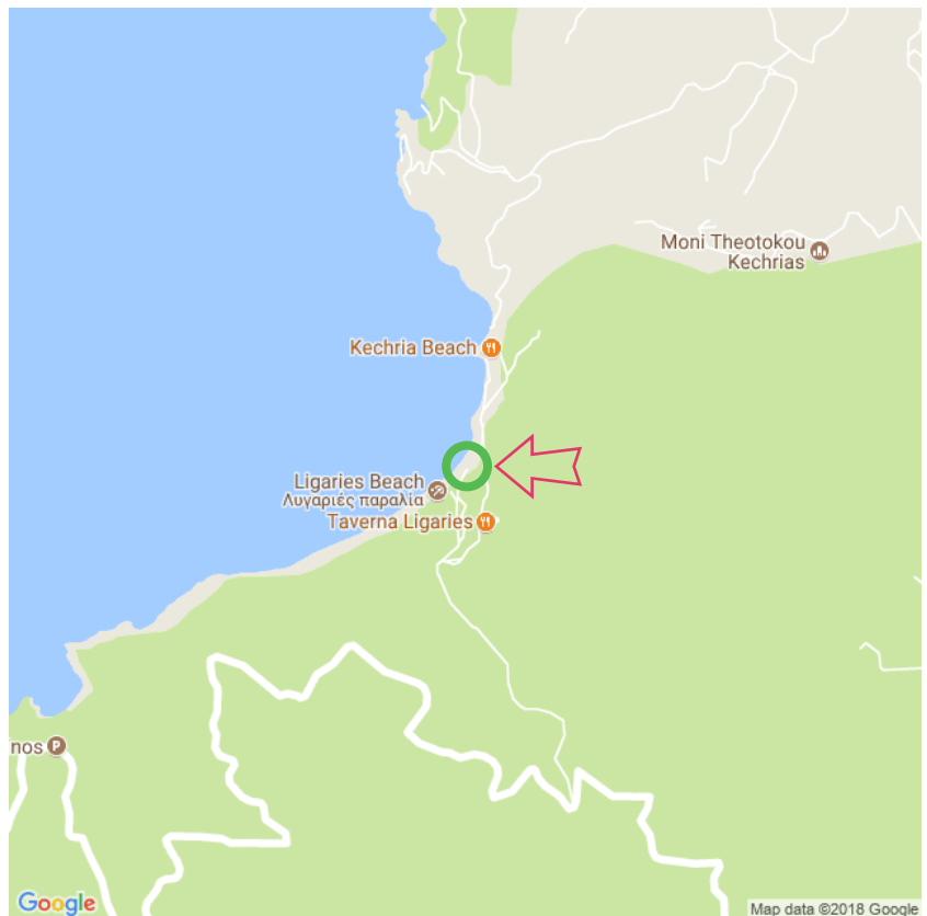
Ligharies Beach (24-02-2018)