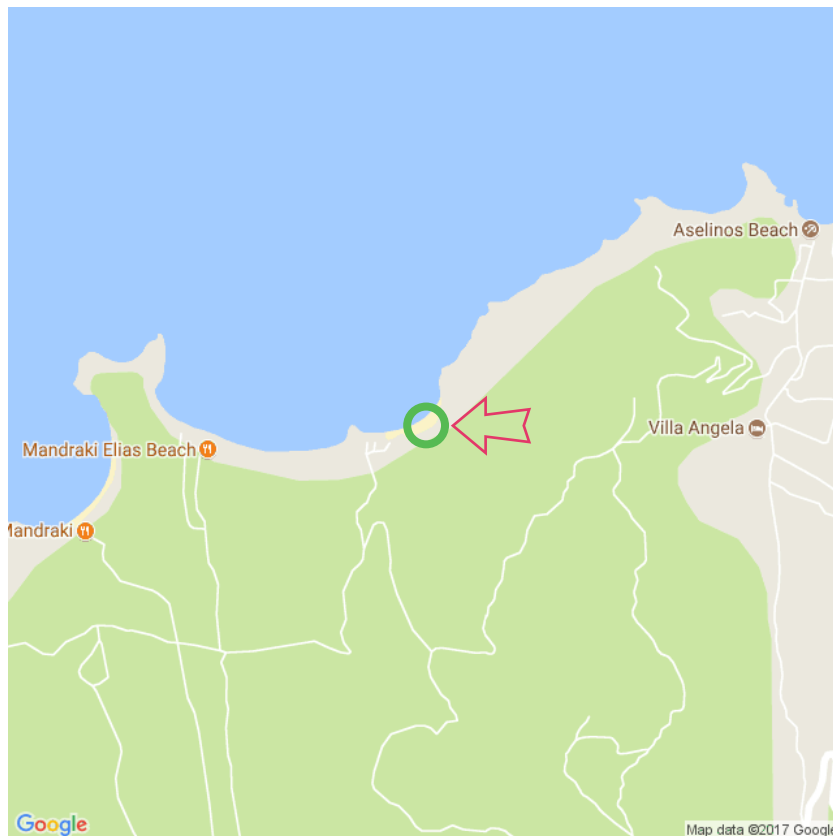
Elias beach (23-11-2017)