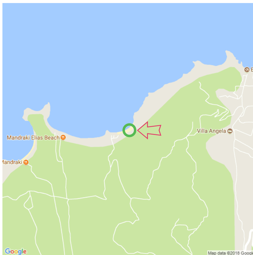
Elias beach (22-03-2018)