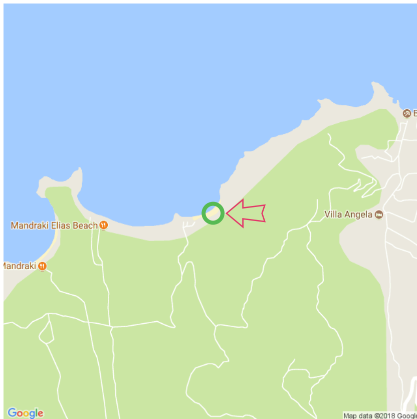
Elias beach (21-01-2018)