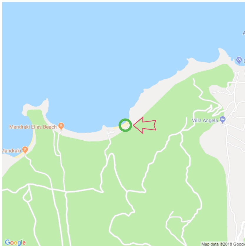
Elias beach (16-07-2018)